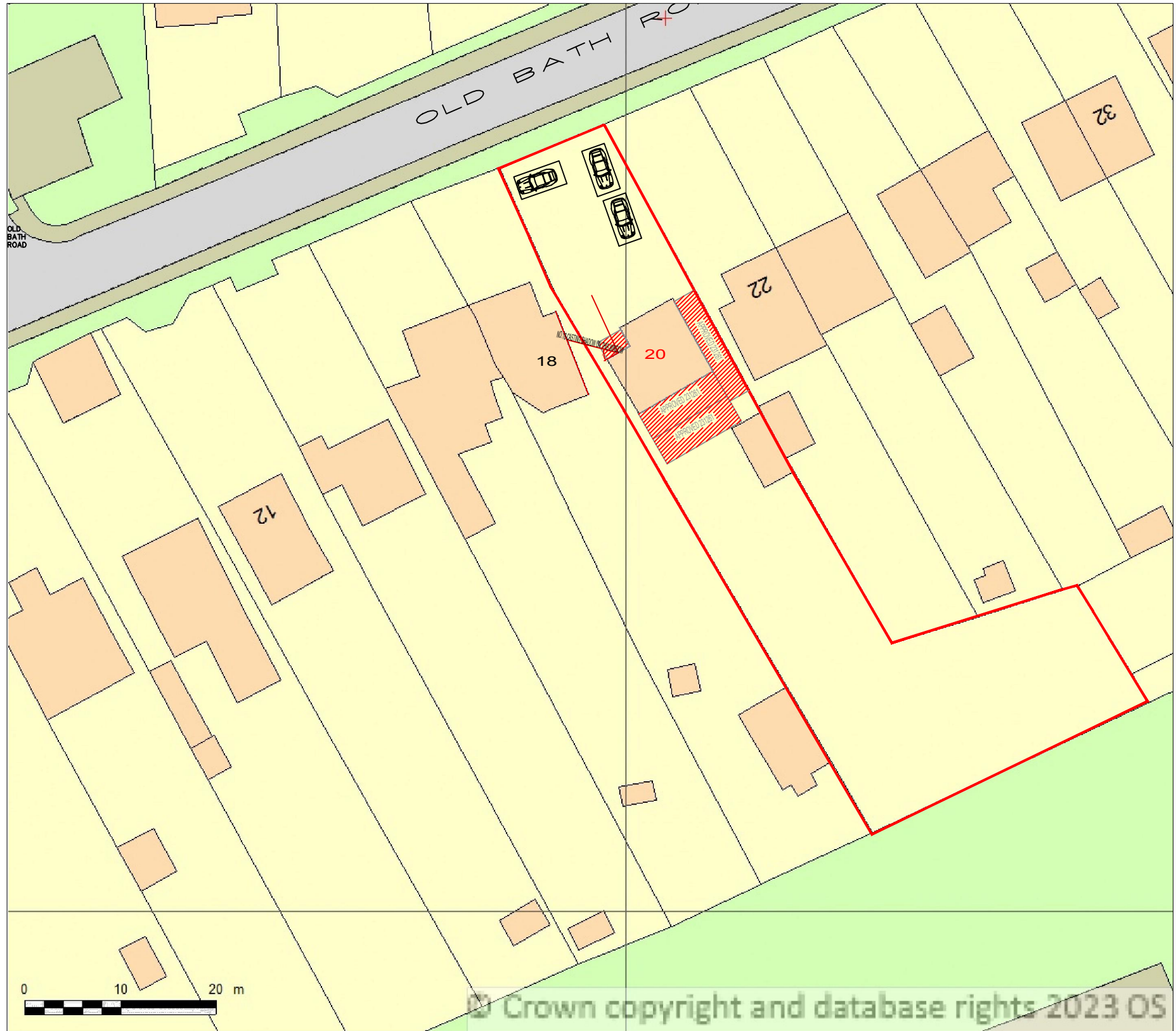
BLOCK PLAN SCALE 1:500@A3